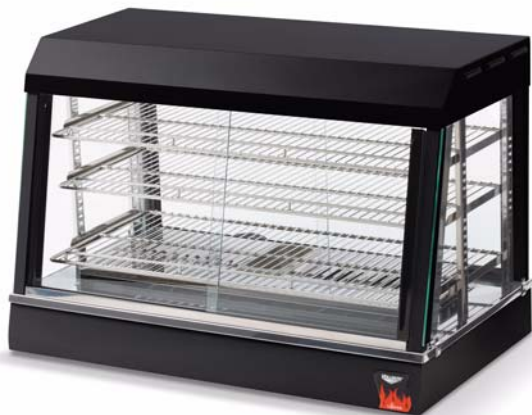
Cayenne® Hot Food Merchandiser