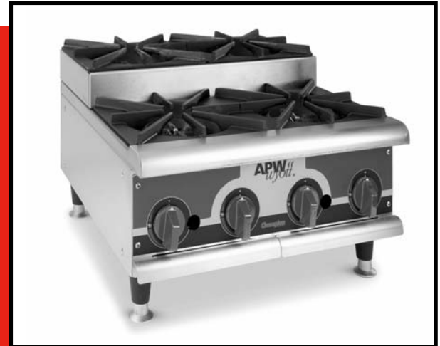
Model GHPS-4H Stepped Gas Hot Plate

*Warranty does not include cooking grates or fireboxes