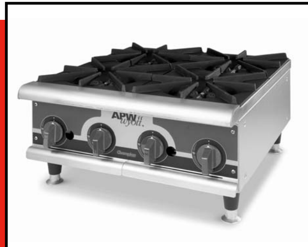
Model GHP-4H Standard Gas Hot Plate